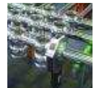
Most modern equipment for construction and production