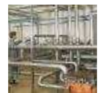
Company owned test center for new developments and product control