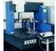
Quality control with program controlled machine

We are looking forward to seeing of service to you.